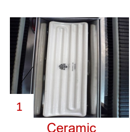
Cheaper and Reliable